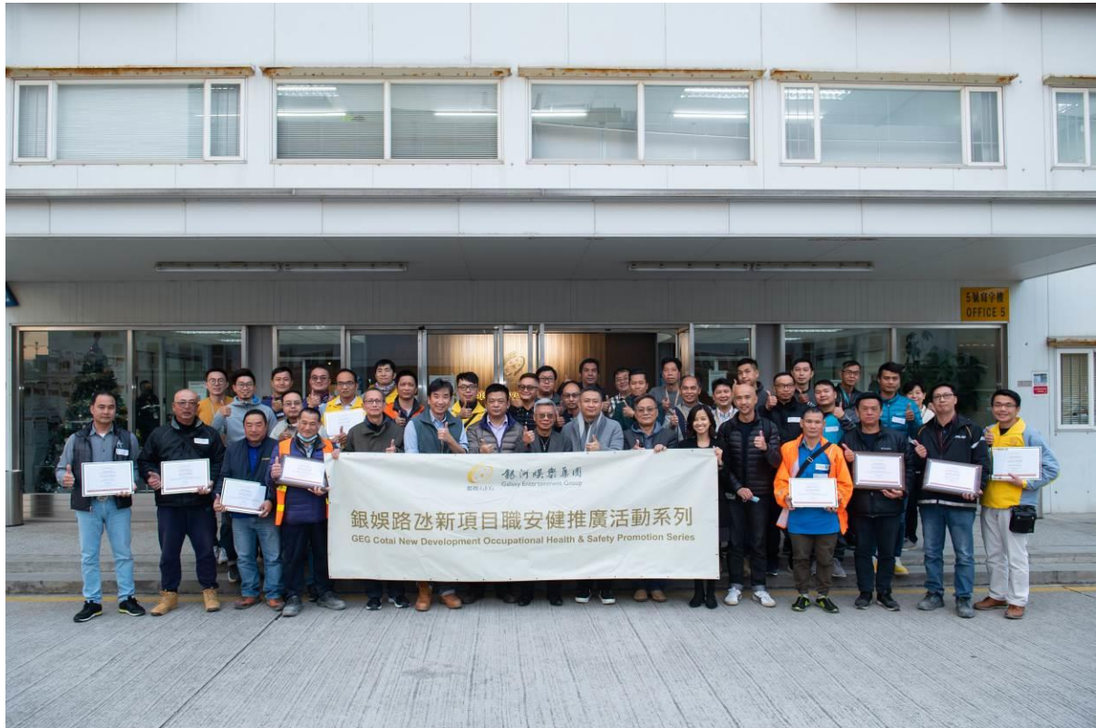
P001: The Project Development Department of GEG organized the “Best Safety Award 2020” award presentation activity.