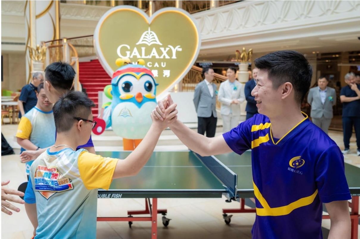
P004: Members of GEG Staff Social Club's Table Tennis Team teamed up with MSO athletes in the "Inclusive Doubles".