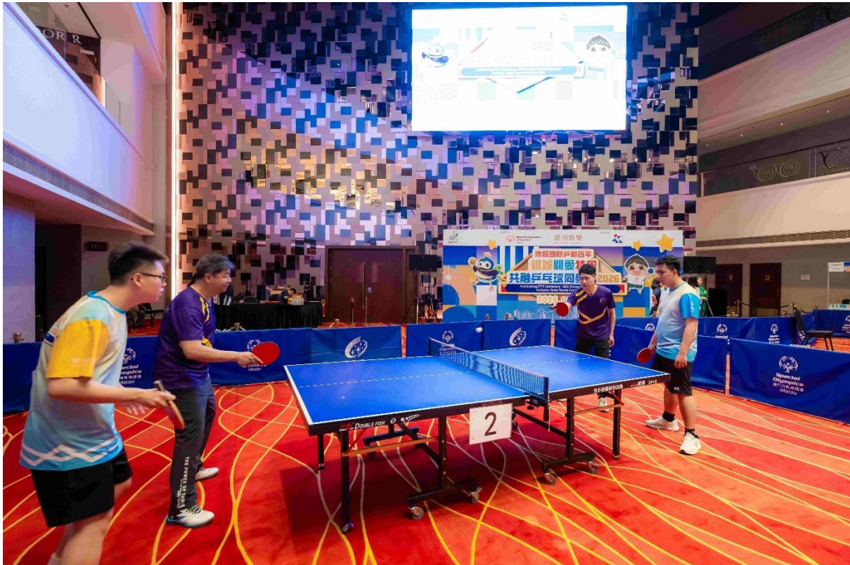
P006: The Fun Day featured multiple table tennis competitions at Broadway Macau™.