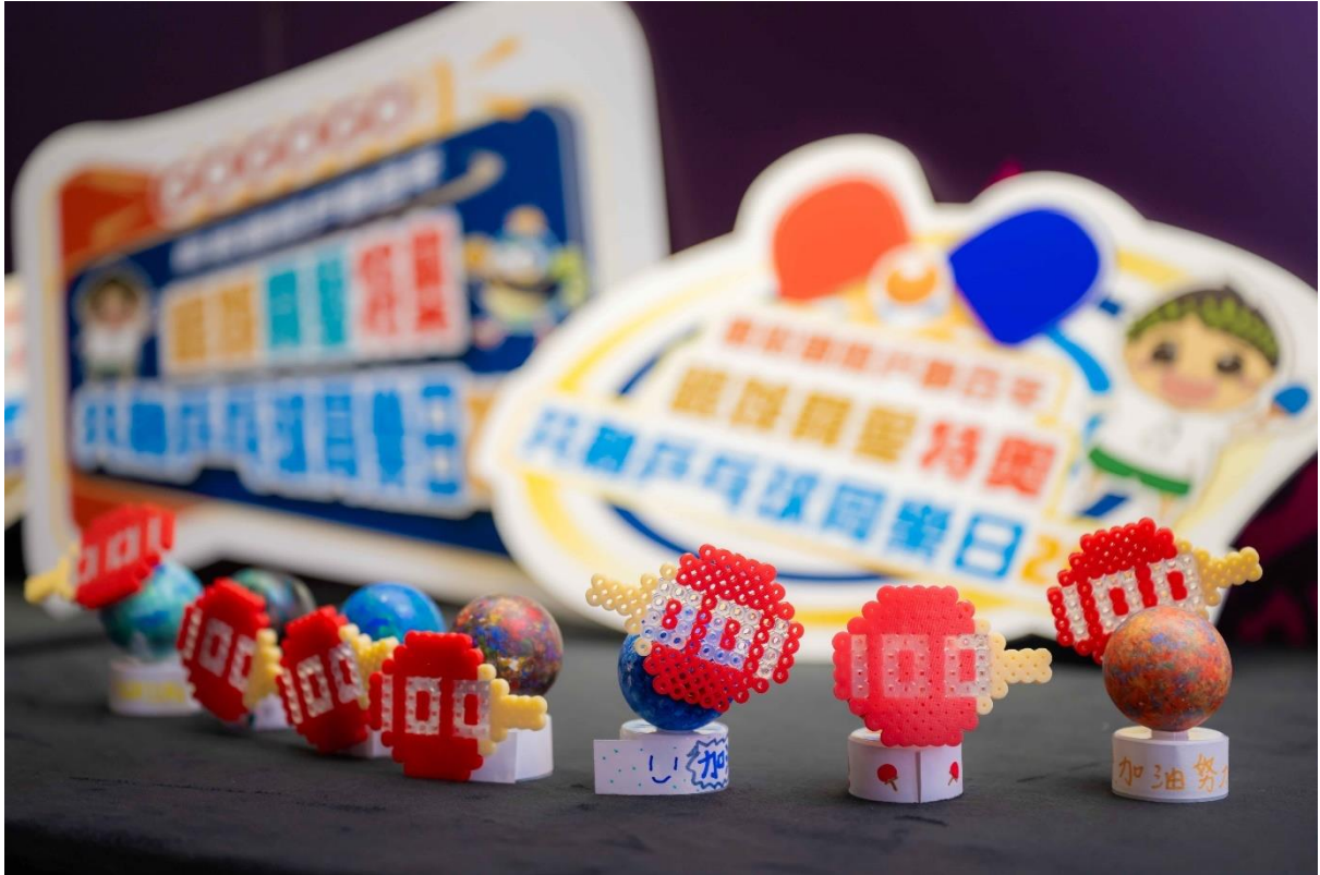
P006: The ping pong ball night lamps were showcased at the Fun Day.