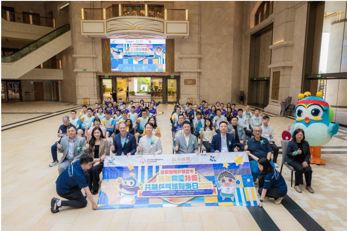
P001: GEG and MSO held the opening ceremony of “Celebrating ITTF Centenary – GEG Macau Special Olympics Inclusive Table Tennis Fun Day 2026” at the East Square of Galaxy Macau™.