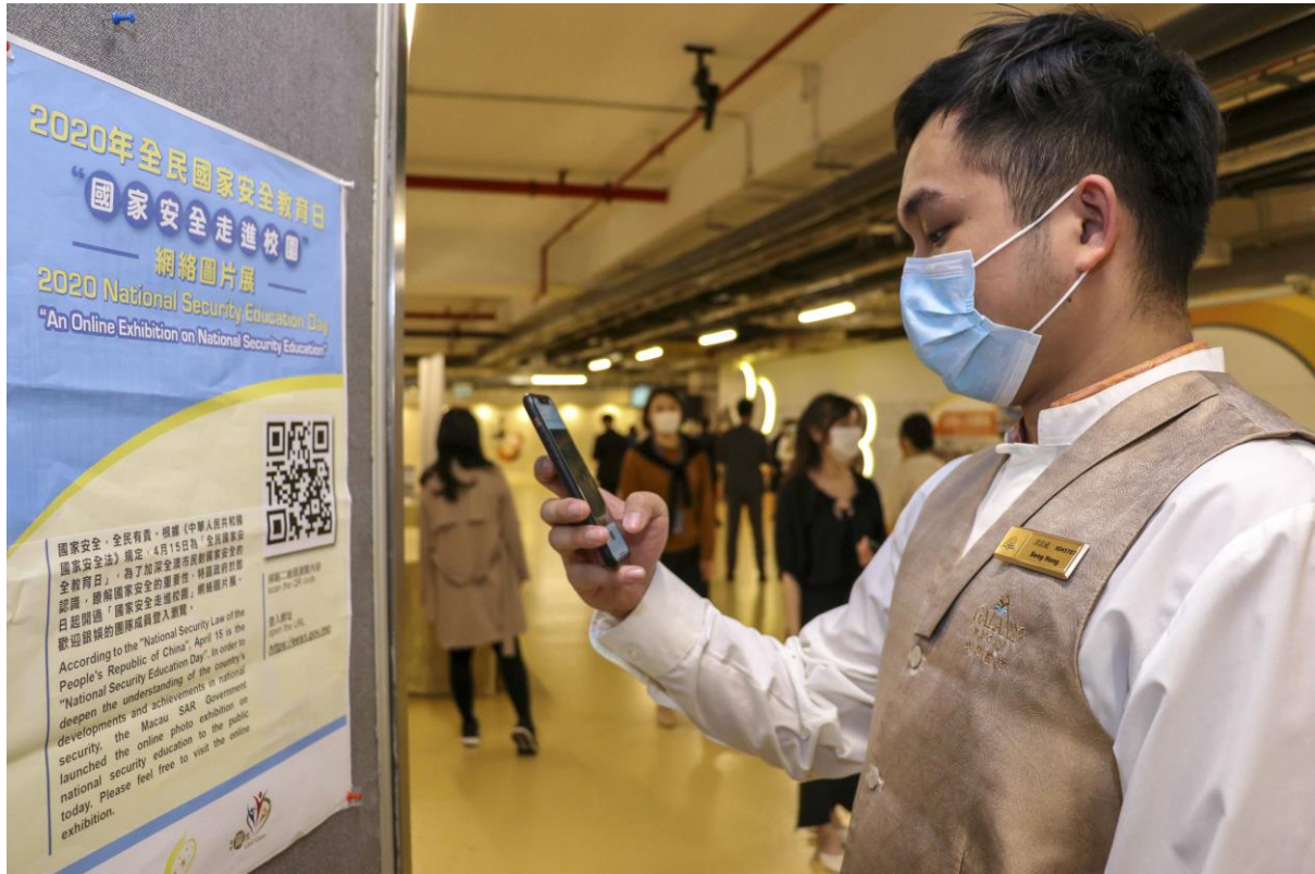
P001: GEG promoted the national security photo exhibition among team members through a variety of internal communication channels.