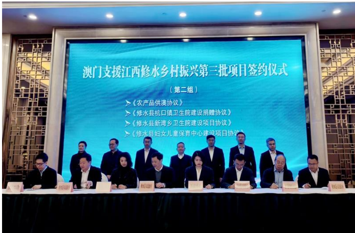
P002: In the presence of distinguished guests, GEG's representative signed the agreement on the "Xiushui County Women and Children Care Center Construction Project" with officials from Xiushui County, Jiangxi Province.