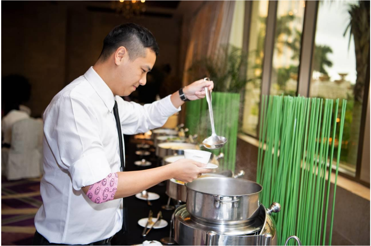
P004: Refreshments were served for the donors.