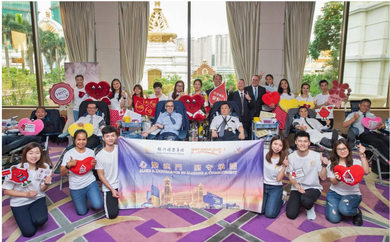
P001: GEG held its 11 th annual blood donation event, in conjunction with the Macao Blood Transfusion Services of the Health Bureau of Macau SAR Government.