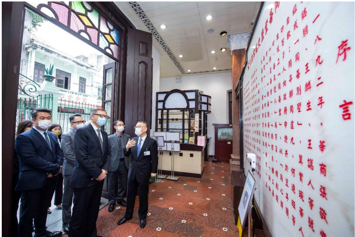
P002: GEG's executives were led by delegates of Tung Sin Tong for a visit to the Tung Sin Tong Historical Archive Exhibition Hall.