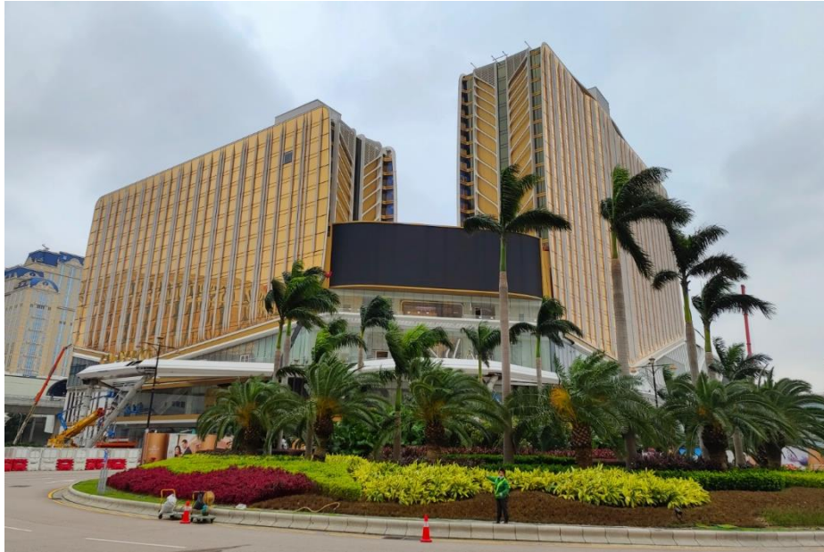
The latest photograph of Galaxy International Convention Center, Galaxy Arena and Andaz Hotel towers