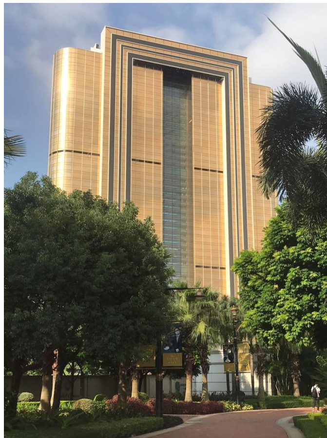
The latest photograph of Raffles at Galaxy Macau

We intend to follow this with the opening of the GICC and Andaz Macau in anticipation of the recovery of the MICE and entertainment markets. And, finally, we continue to proceed with the construction of Cotai Phase 4, our next generation integrated resort, which will complete our ecosystem in Cotai. As you can see, we remain highly confident about the future of Macau where Cotai Phases 3 and 4 will support Macau's vision of becoming a World Centre of Tourism and Leisure.