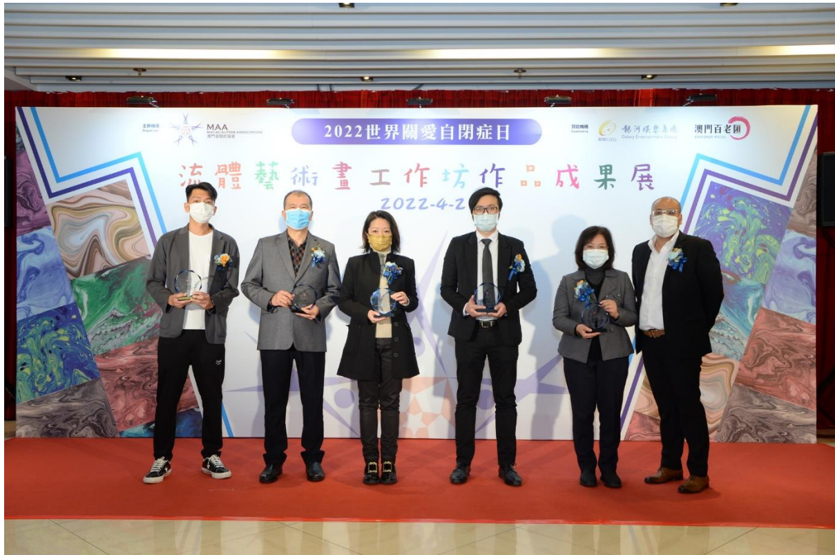
P001: GEG supported the fluid painting exhibition held on the mezzanine floor of Broadway Macau.