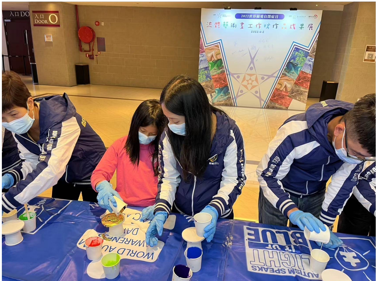
P004: GEG arranged volunteers and their children to engage in the fluid painting workshop, where they enjoyed a warm parent-child moment.