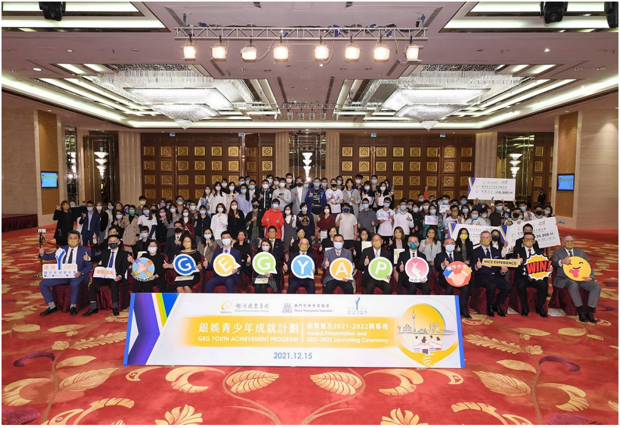
P001: GEG and MMA held the 10th YAP Award Presentation and the 11th YAP Launch Ceremony.