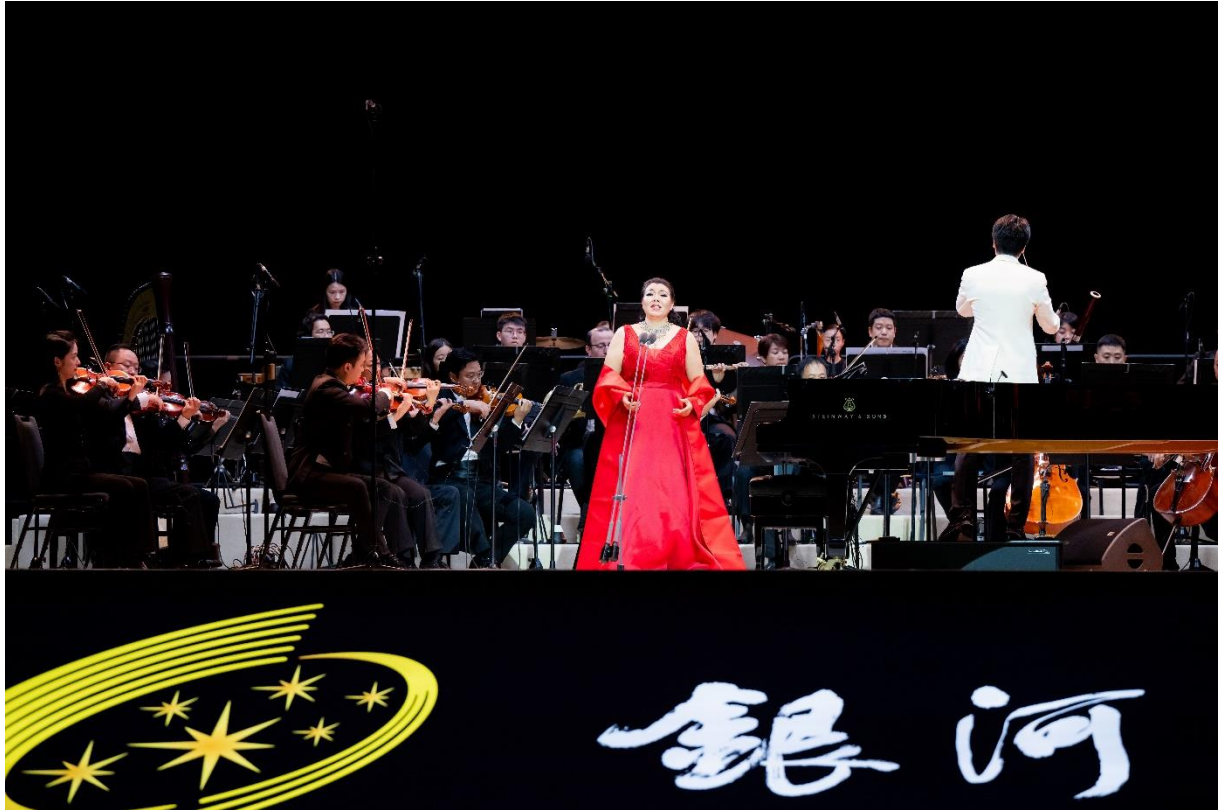
P004: The event's atmosphere was elevated by a well-applauded performance by globally renowned soprano Ms. He Hui, joined with nearly 50 musicians from the Macao Orchestra.