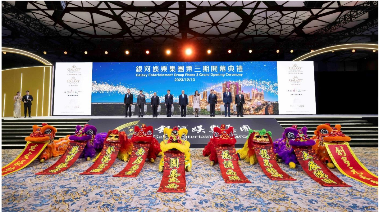
P003: The officiating guests took a photo with the lions, wishing GEG a vigorous future and industry-leading development.