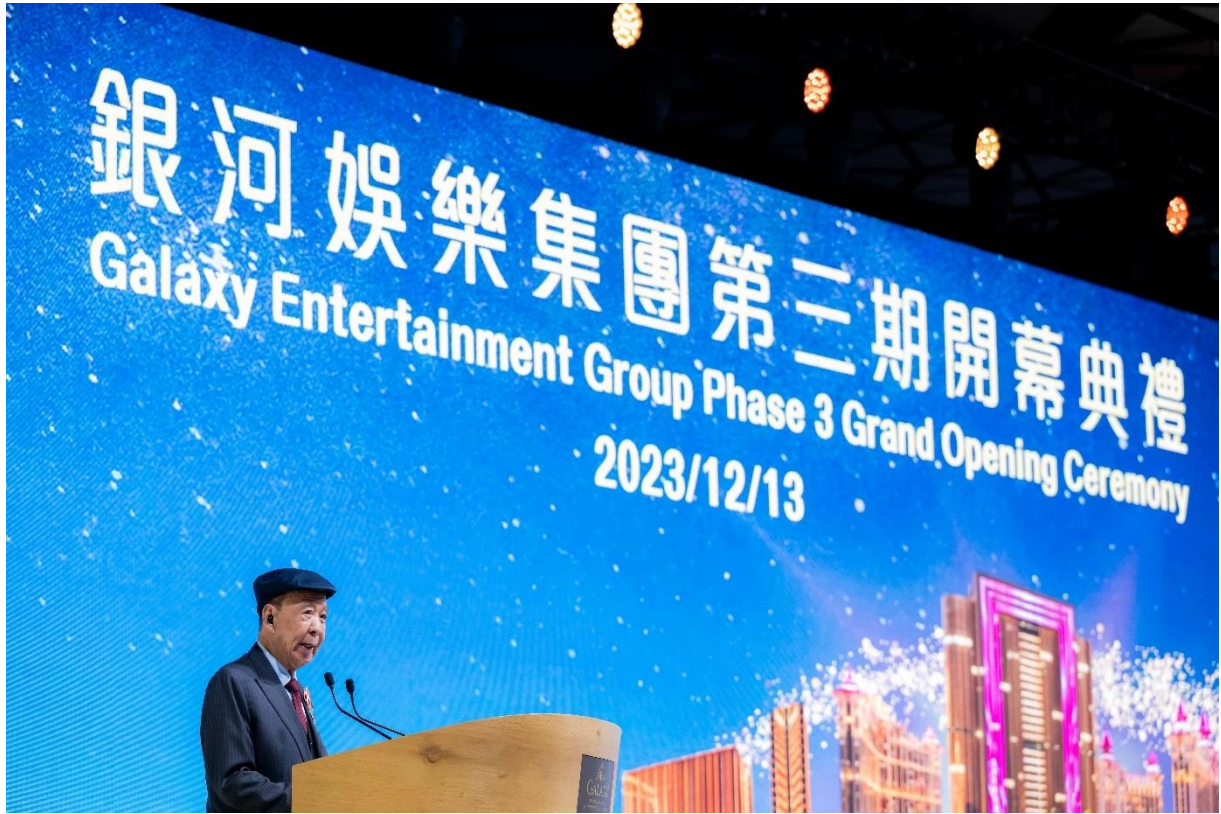
P002: Dr. Lui Che Woo, Chairman of GEG, delivered a speech.