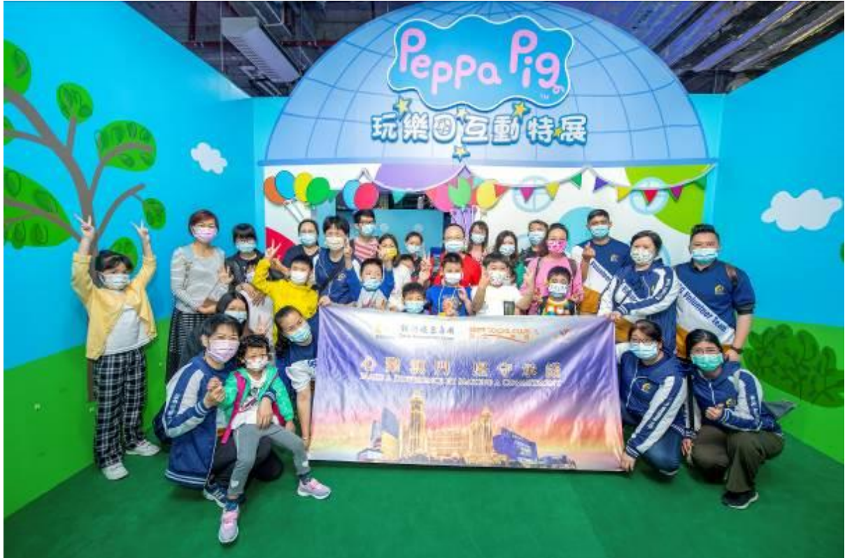
P001: Earlier, GEG invited families from MAA and AFEDMM to the “Peppa Pig Happy Day Interactive Fun Fair – Macau” exhibition.