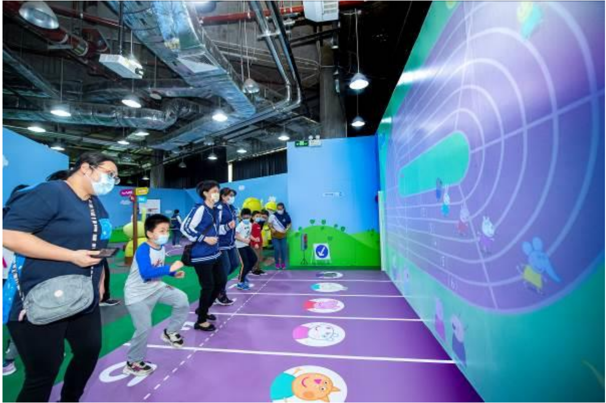
P002: Accompanied by GEG volunteers, the participants enjoyed the games and took photos with the cartoon characters.